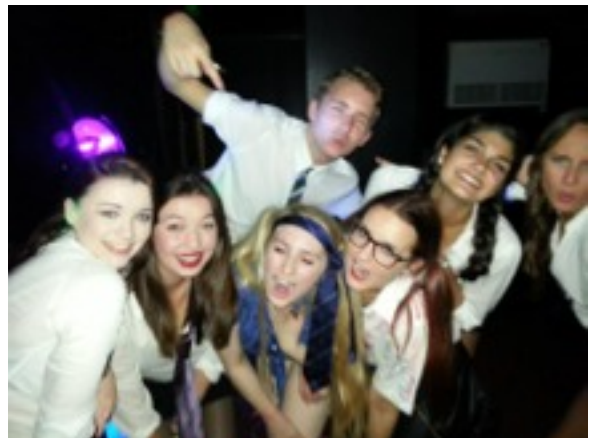
Back To School 2012

Swaps are also a good way to meet people; a group from Trinity will arrange to meet a group from another college and go to either college's bar and formal / or a restaurant outside.