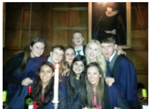
Formal Hall - go to the bar beforehand to buy wine and compare outfits.