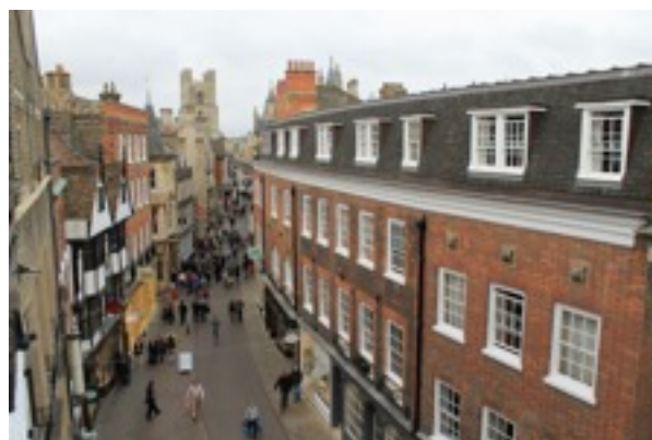
You can get most things in Cambridge town centre

Internet cables - we will give you one when you arrive.