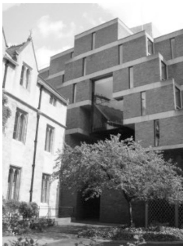
The Wolfson Building

If you lock yourself out, don't panic: the Porters have spares to every room.