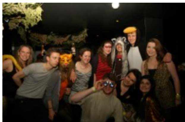
Rumble in the Jungle WPR