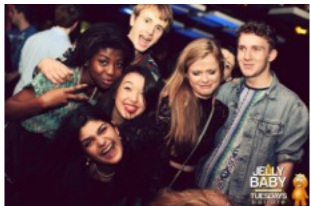
Undoubtedly a Cindies night.

Lola Lo is a Polynesian themed club spread over three floors. Rivaling Life on Thursday nights it boasts attractions such as cocktails served in coconuts.