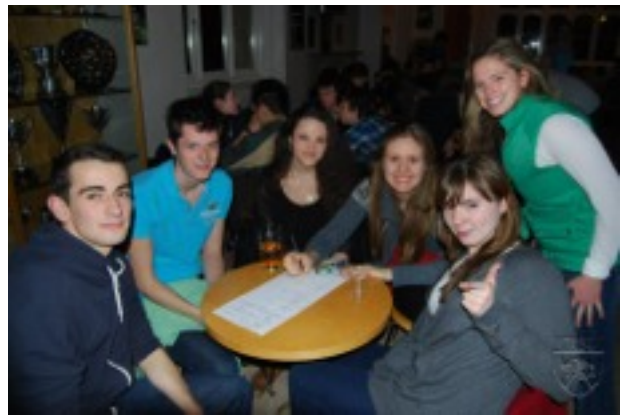
Quiz Night in the Bar

outside as well, so going there is a pretty good idea all round.