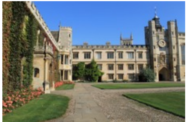
Great Court in the sun.

This is in Blue Boar and is used for some lectures and also events such as stand up comedy shows.